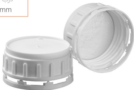
درب سایز 47 mm