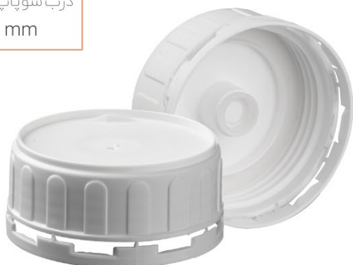
درب سوپاپ دار سایز 60 mm