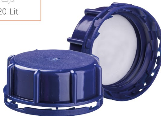
درب 20 Lit