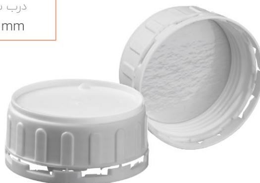
درب سایز 60 mm