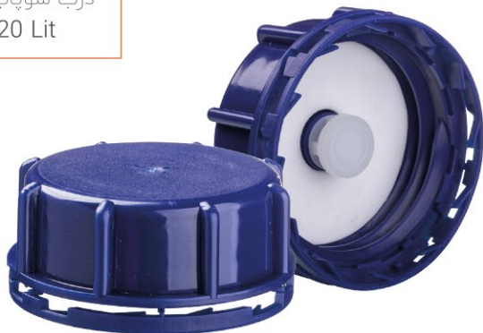
درب سوپاپ دار 20 Lit