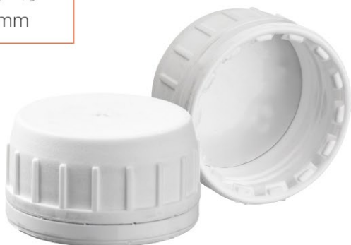
درب تیغ خور 36 mm